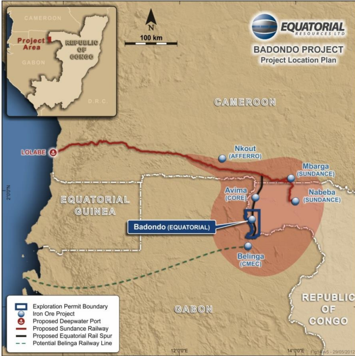
Figure 1: Badondo Project Location