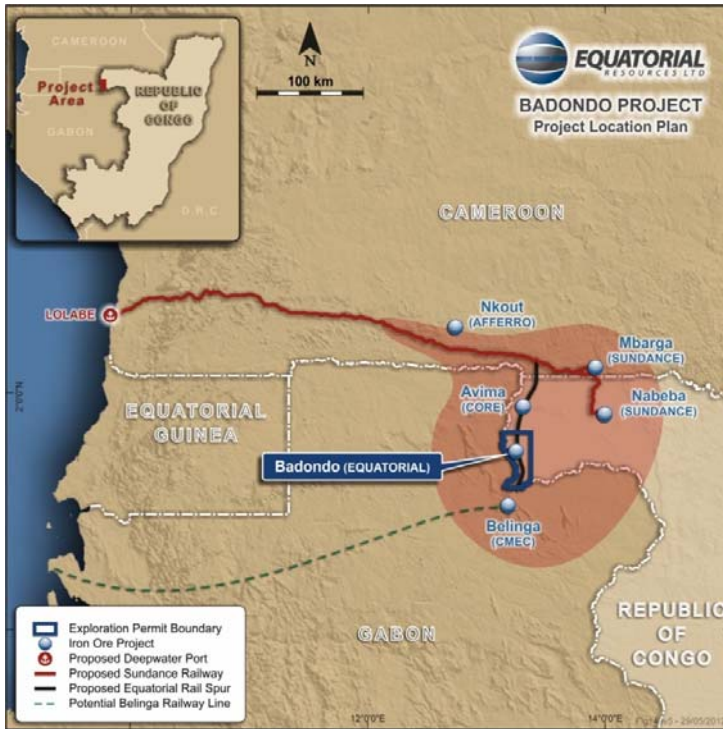
Figure 1: Badondo Project Location